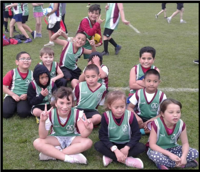
Amazing first games U8 Super Stars! Fantastic listening and playing!

Please make sure that your fees are all paid up. The cost is $35 per child. This is subsidised by the school and without your contribution we are unable to be involved in so many sports.