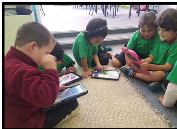
Fun In Room 14