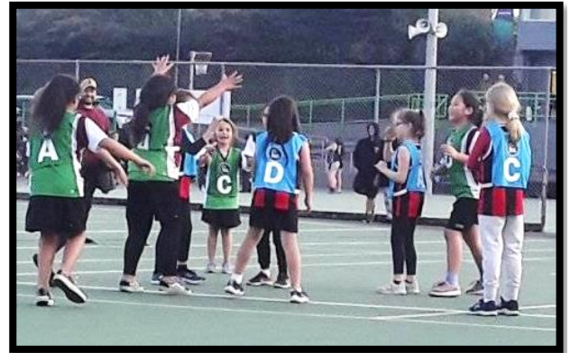
Year 3/4 Netball team in action