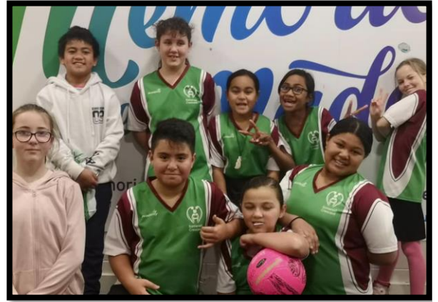
Year 5/6 Netball Team