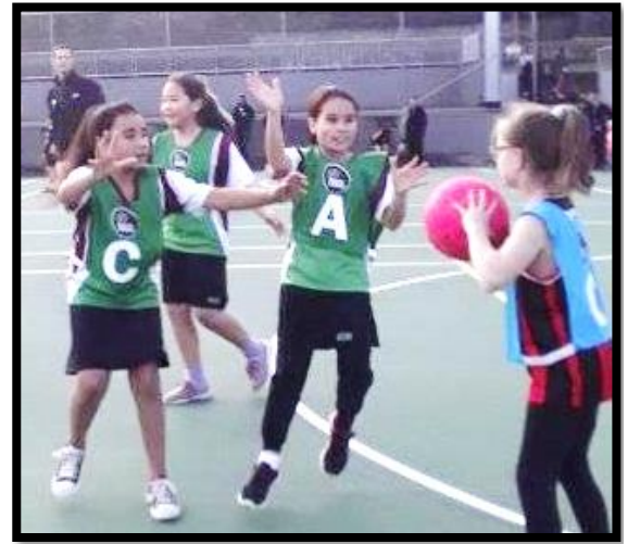
Netball girls in action