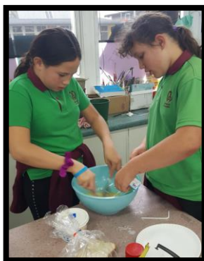
Room 2 made some French bread 'Samoan style'