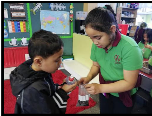
Room 7 - Planting our bean seeds with our buddies in Room 9

Last weekend, we had two new basketball hoops installed on the courts outside the Kowhai Team. Now our Kowhai kids can play basketball in a space that is dedicated to our younger tamariki. Our students in the picture (all from Room 12) are showing their excitement over their new hoops!!