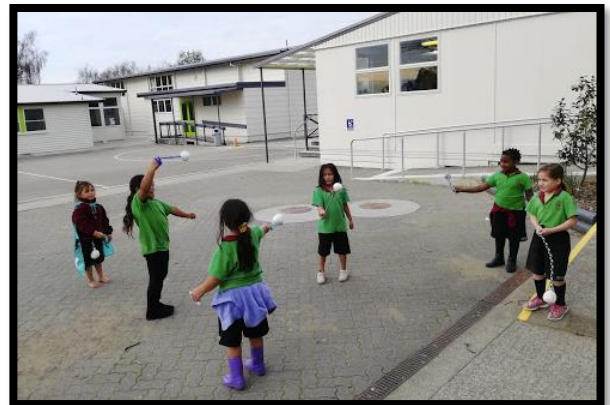
Room 7 - hanging out with our buddy class in Room 11