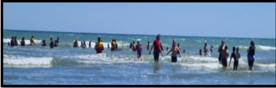
Kahikatea Team Himatangi Beach trip

Fees for Hockey are $20, please pay at the school office.