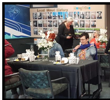
Support Staff Breakfast