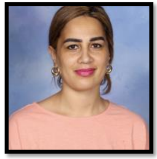
Star Staff Award

For all their amazing work with He Haupihi ki Hine and preparing for Pae Tamariki