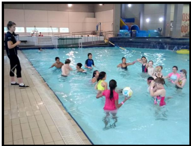
Flipperball practise at the Lido.