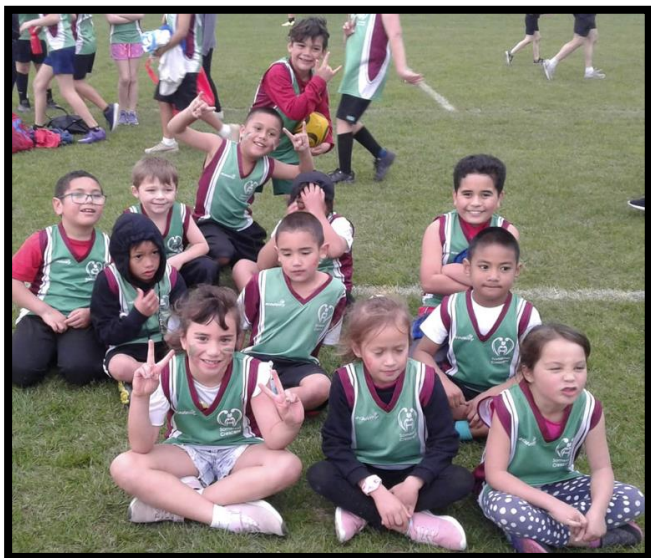
Amazing first games U8 Super Stars! Fantastic listening and playing!

Please make sure that your fees are all paid up. The cost is $35 per child. This is subsidised by the school and without your contribution we are unable to be involved in so many sports.