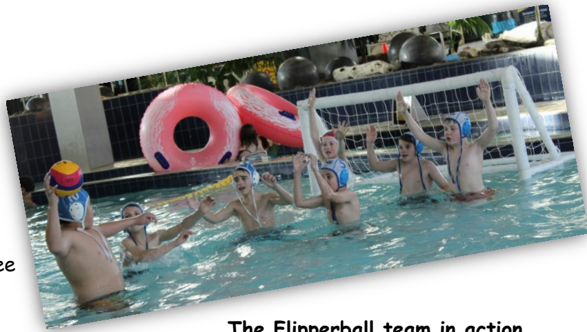
The Flipperball team in action last term

Touch starts on Friday the 23 rd of October. Under 7's & Under 9's - Game 1 - 4pm Game 2 - 4.30pm. Meet between the Gym and classrooms (Monrad Park) at 3.45pm Under 11's - Game 1 - 5pm, Game 2 - 5.30pm. Meet between Field 9 & 6 at 4.30pm (You will see our other Somerset teams playing on these fields). Play hard and play fair.